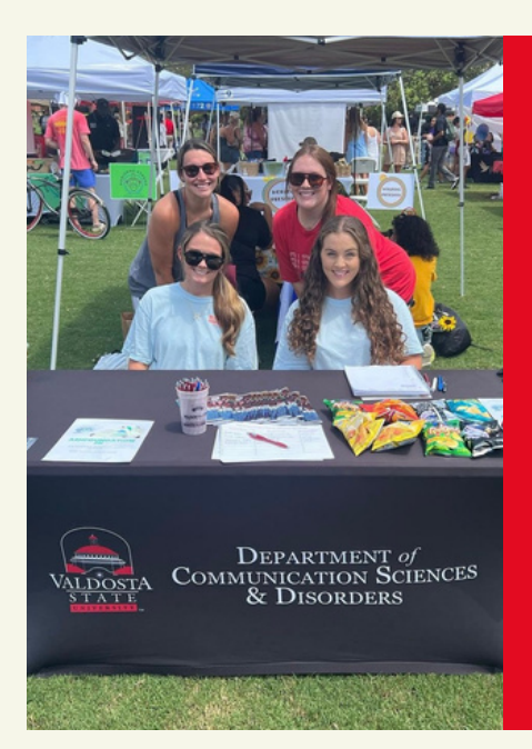
The Happening is an annual student life event held every fall on the VSU front lawn. The Department of Communication Sciences and Disorders had a booth at the Happening in which NSSLHA members and graduate assistants encouraged involvement in the CSD program.