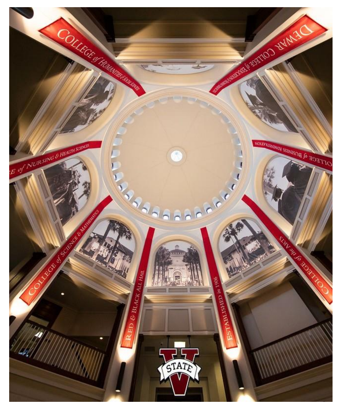
Valdosta State University