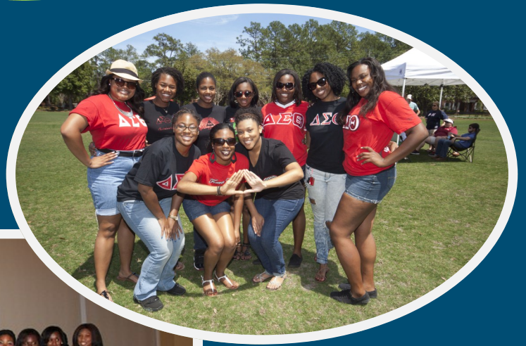
Delta Sigma Theta