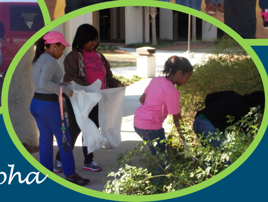
Alpha Kappa Alpha