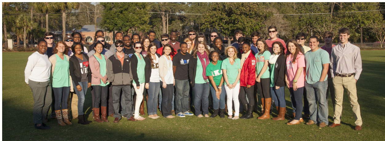
The VSU Greek Newsletter Parthenon is brought to you by Greek Ambassadors

While we have accomplished a great deal this year by raising over $121,981 and donating 23,700 hours of service to the greater community, there is still so much left to be done. We are further along the road to Greek Housing than ever before which means that the VSU community is watching us closer than ever. Your alumni are looking for a reason to rejuvenate their passion and dedication to your chapters... local high school students (and parents) are watching from afar trying to decide if they will seek membership... faculty and staff are making decisions every day about how they feel towards Greek students. Give all of these individuals every reason to believe in you, to trust in the future of Greek Life and Greek students. Don't give them any reason to doubt you, your efforts or your values. Be the men and women you say you are...let others know what your organization values through your actions. Be the men and women your founders would be proud to call sisters and brothers. I look forward to another exciting year and a thrilling time to be Greek at VSU.