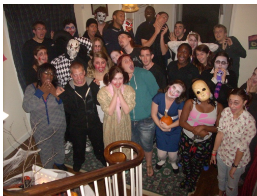
The cast of Rolling Meadows Daycare

The theme of this year's house centered on a daycare full of crazed children because, well, kids can be creepy! Some of the guests refused to go in, and others ran screaming from the house! Clowns, tricycles, and plenty of scary "kids" frightened over 275 guests over three nights. This year's attraction ran from October 27-29 from 8 pm to 12 am. Tickets were $3, and part of the proceeds bene-