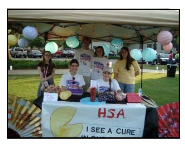
Some of our volunteers at our China tent!

At the event, HSA chose China as the theme for the tent, and team members sold fortune cookies and