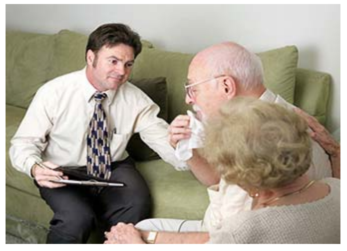
Many marriage and family therapists work in private practice.

Marriage and family therapists held about 41,500 jobs in 2016. The largest employers of marriage and family therapists were as follows: