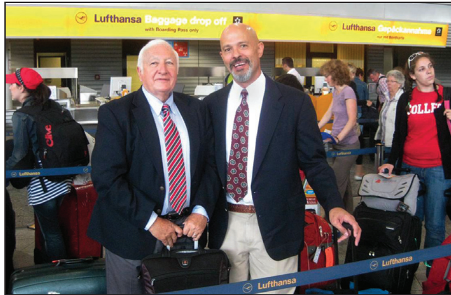
Professors and students alike take advantage of learning opportunities at manufacturing firms..