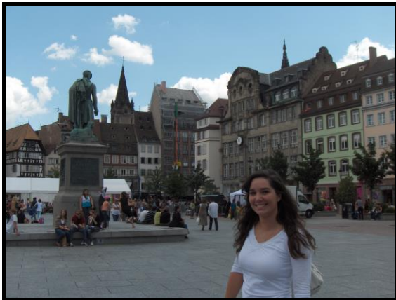
CITY CENTER IN STRASBOURG

Participants purchase their own airline tickets and commit to arrive in Paris by Wed., June 24, 2015.